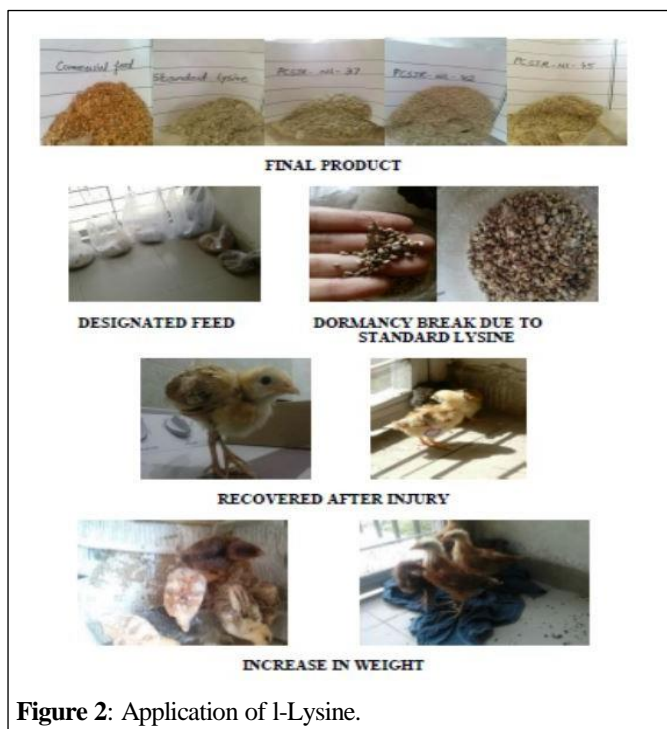
Figure 2: Application of L-Lysine.

product was filtered and calculated the respective amount of lysine benevolence. For the production of feed, vigorous expanse of L-lysine produced in a culture broth was purloined and then jumbled with the plant material i.e. Pennisetum glaucum (L.)R. Br [17-22]. This intermingled material was daubed together for 2 days till the seeds of the plant utterly engross the product. When the seeds are absolutely soaked in the product, it was spread on a piece of newspaper and consigned in open air for drying. After 2 days the experimental feed was ready for trial usage (Figure 2).