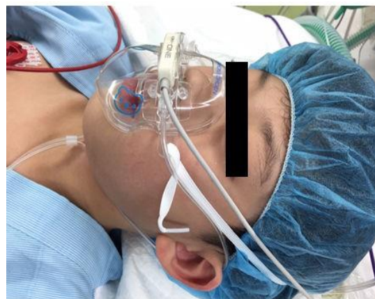
Figure 1: Cap-ONE mask (medium size) and mainstream \text{CO}_2 measuring probe on a patient face.

Demographic information was collected for eligible participants. Children were classified into two groups according to their body weight (the small group as 7-20 kg; the medium group as 20-40 kg). Use small group <20 kg wore the infant Cap-ONE mask, whereas the medium group >20 kg wore the pediatric Cap-ONE mask according to the manufacturer instructions. All patients were extubated in the operating room and transferred to ICU with a normal oxygen mask.