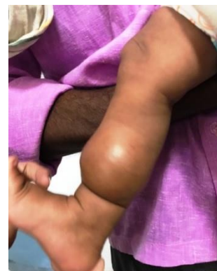
Figure 1: Clinical photograph shows a fusiform swelling at the distal end of left leg involving ankle.

colour with normal surrounding area (Figure 1). The swelling was soft in consistency, non-tender, mobile and compressible. Regional lymph nodes were not enlarged. Systemic examination was normal. On the basis of above findings, a provisional clinical diagnosis of haemangioma was made.