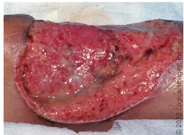
Figure 1. Pyoderma Gangraenosum

Copyright: © 2024 Rohl T. This is an open-access article distributed under the terms of the Creative Commons Attribution License, which permits unrestricted use, distribution, and reproduction in any medium, provided the original author and source are credited.