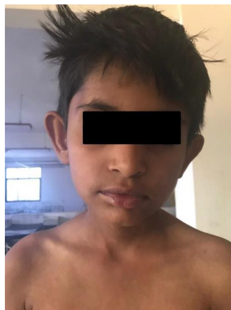
Figure 1: Low set and bat ears.

An 8-year-old, female child presented to our department of pediatrics with chronic cough, delayed developmental milestones and learning difficulties. She was a child born out of a non-consanguineous marriage at term gestation. Post-natal history included complaints of myoclonic jerks for which no consultation was sought. Family history is not suggestive of any linkage. Also the child had a history of gastro esophageal reflux. No history of breathlessness, cyanosis or wheezing.