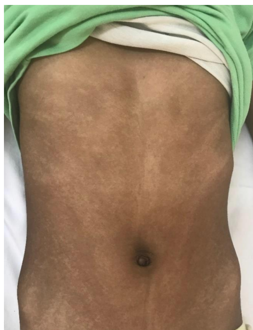
Figure 4: Streaks along the lines of blaschko on the trunk.

with extracutaneous anomalies in 75% of cases. Gene mosaicism of a locus is the underlying basis of pigmentary mosaicism. Familial linkage is rare in these cases. Around 60% of paediatric cases with widespread pigmentary mosaicism are found to have gross chromosomal abnormalities and/or noncutaneous abnormalities on peripheral blood leukocyte and fibroblast or keratinocyte evaluation. However majority cases do not show extensive involvement with pigmentary mosaicism and have no other problems on taking history along examination. Uese cases may not be investigated further but early diagnosis and intervention can drastically improve the prognosis of the disease.