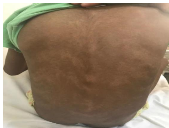
Figure 5: Back.